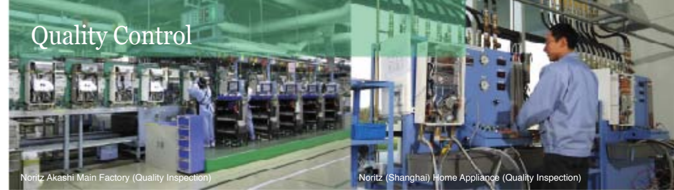
Noritz Akashi Main Factory (Quality Inspection)