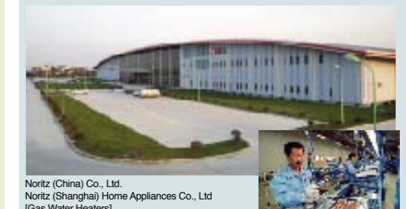
Noritz (China) Co., Ltd. Noritz (Shanghai) Home Appliances Co., Ltd [Gas Water Heaters]