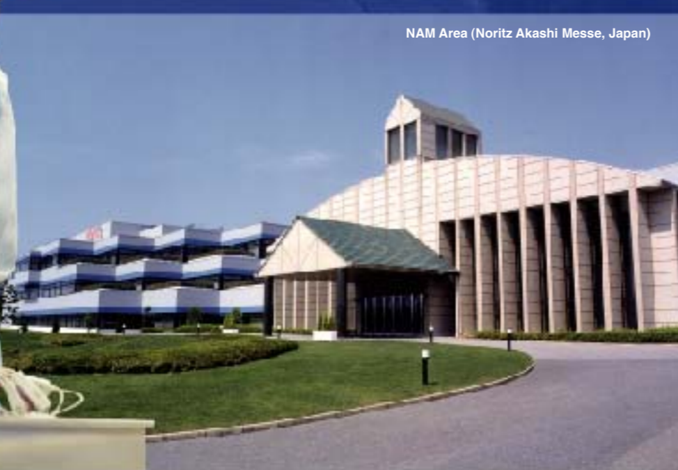
NAM Area (Noritz Akashi Messe, Japan)

More relaxing bath time for people all around the world. Noritz is constantly innovating our production technology to realize higher quality, transmitting cutting edge technology to the world.