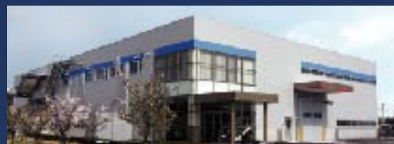
Production Engineering Development Center

At Noritz's production sites, approximately 18,000 models are being produced in mixed model production. This system enables high production efficiency and product quality, strictly meeting delivery times. This is attracting great attention from the world.