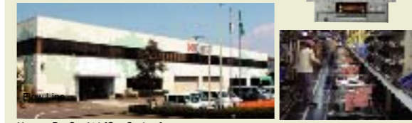
Harman Pro Co., Ltd [Gas Cookers]