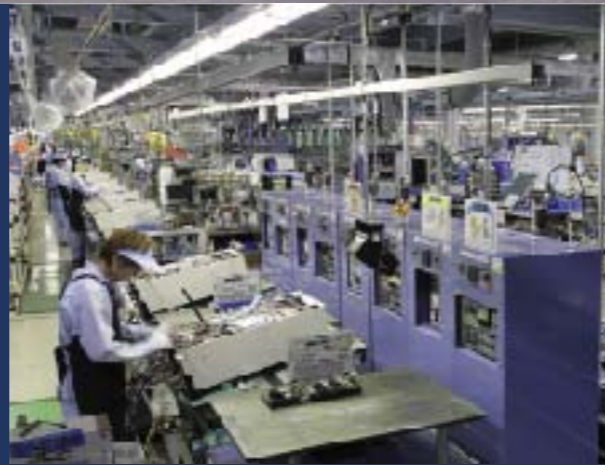
NRPS (Just-in-time System Production Line)