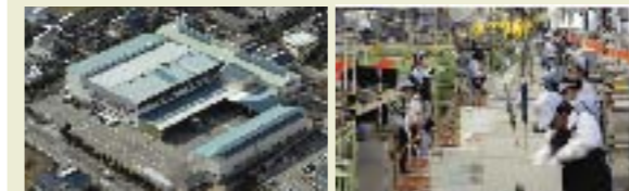
Noritz Tsuchiyama Factory [Gas water heating products]