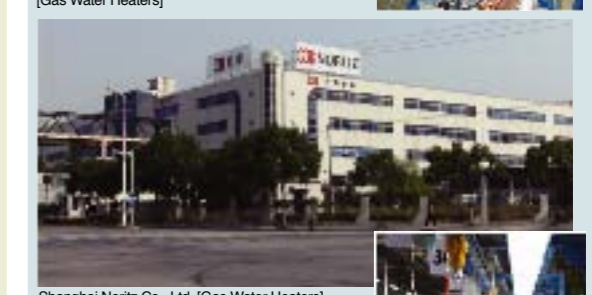
Shanghai Noritz Co., Ltd. [Gas Water Heaters]