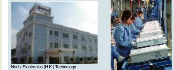
Noritz Electronics (H.K.) Technology [Remote Controllers, PCBs] (Guangdong)