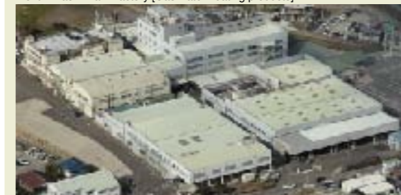
Noritz Akashi Factory [Kerosene water heating products]