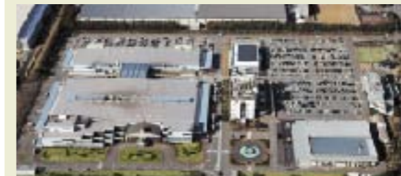
Noritz Akashi Main Factory [Gas water heating products]